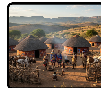
What people think