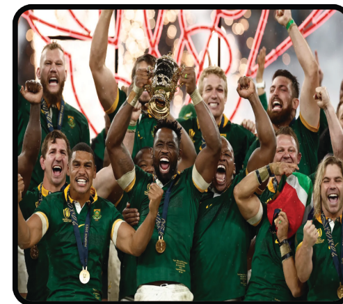
South African rugby team

South Africa is a country on the southern-most tip of the African continent. In many ways, South Africa is substantially different from South Korea in several key areas, especially regarding extracurricular activities. Here, sport is integrated into the curriculum all the way up to grade 12. Every Tuesday and Thursday from 3PM to 5PM, we are required to take part in a sports club of some sort. This takes place after classes have concluded for the day and is mandatory. There are often matches against other schools on Saturday mornings. The most popular sports in South Africa are soccer, rugby, cricket and swimming. For those less physically inclined, you are still required to participate by joining less physically demanding sports like chess. In this way, South African children grow up physically active. In South Korea, however, academy culture presents a huge barrier to students achieving their recommended amount of physical activity, which is unfortunate. SA sports culture has led to us being dominant rugby world champions and setting world records across a wide variety of sports. We even have a UFC middleweight champion!