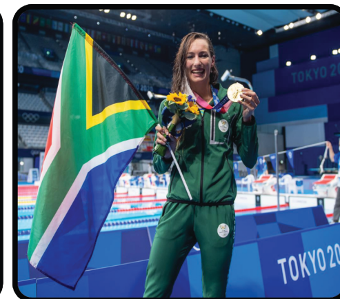
Tatjana Schoenemaker, 200m WR