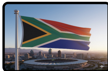
The flag of South Africa

The flag of South Africa has many colors. It is called the "Rainbow Flag." Black is for the black people. White is for the white people and for peace. Gold is for the gold and diamonds. Green is for the land and the fruit. Red is for the painful history. Blue is for the sky and the oceans. There are many different kinds of people living in South Africa. We all try to work together to make our country the best it can be.