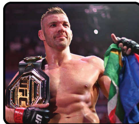
Driscus du Plessis, UFC middleweight champion