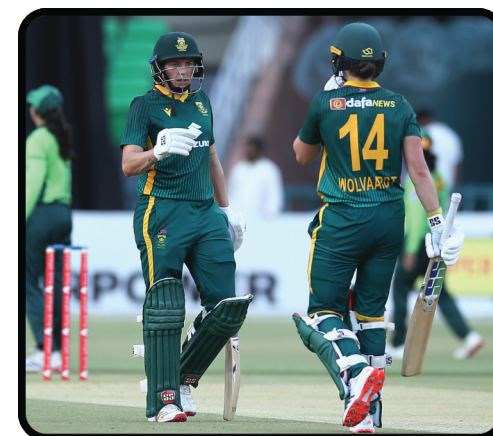
South African cricket team