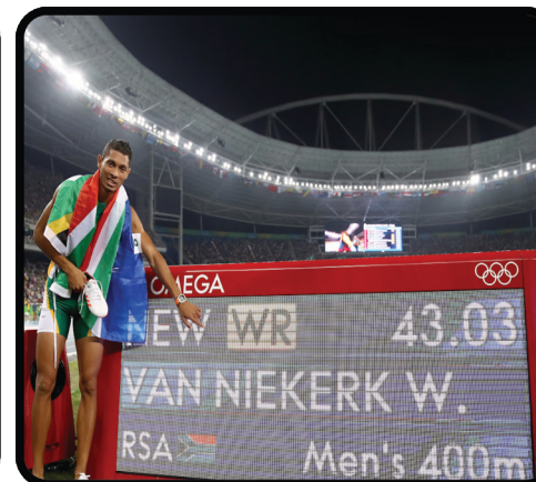
Wayde van Niekerk, 400m WR