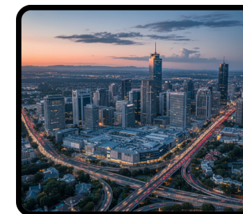
The real South Africa

I come from South Africa. When I tell this to people they often don't believe me. They think South Africa is like the other African countries they see on TV. They expect it to be a very poor country with no electricity and animals walking all over the place. They are also very surprised that I am white because they think only black people live in South Africa! In actuality, South Africa is a very modern country. It is similar to many European countries. South Africa is famous for its gold and diamond mines, too. We also have many farms and grow a large amount of fruit. Some of the fruit you eat in South Korea comes from South Africa, too. South Africa is called a "melting pot" because people from many different cultures live and work together. You may wonder how we communicate with each other. Well, there are many different languages in South Africa. We have 12 official languages! The common language is English and everyone in South Africa learns it from grade one.