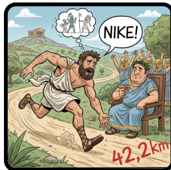
Pheidippides ran 42.2km to Athens

Have you heard the word "marathon" before? The word comes from the ancient Greek legend of the messenger Pheidippides. Following the Greek army's decisive victory over the Persians at the Battle of Marathon, Pheidippides was tasked with running all the way back home to Athens to announce the triumph. His final words to the Greek king were "Nike", which means "victory." This is where the shoe company Nike got its name from. He then succumbed to complete exhaustion. The distance he ran was around 42.2km. In South Korea, you can frequently see the misnomer "5km marathon" but this is actually erroneous because a marathon is always 42.2km in length in tribute to Pheidippides' historic achievement. The modern marathon is one of the most