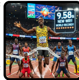
Usain Bolt is a famous sprinter