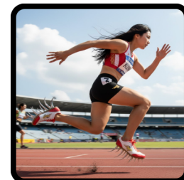
Sprinters wear track spikes

Have you heard about sprinting? People often think of sprinting as just running very fast, but it actually refers to an all-out maximal effort over a short distance. Running and jogging is mostly a form of aerobic exercise, which means it uses oxygen for energy. Sprinting, however, is a form of anaerobic exercise, which means it doesn't use as much oxygen and mainly uses glycogen. This also means you can't sprint for long before you become exhausted. The most common sprinting distances are 100m, 200m and 400m. Sprinters often have more muscular bodies than marathon runners because they need to generate a lot of power in a short time. To help them with this, they wear track spikes.