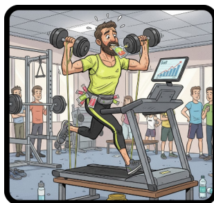
Preparing for a marathon is tough

grueling running challenges imaginable. It takes many months to prepare for the long distance effort and even then once athletes surpass the 30km mark, many of them inevitably hit the wall. This means their muscles completely run out of glycogen and start to cramp. In my experience, the final 10km of the marathon are more about mental toughness than physical readiness. Ultimately, it is a phenomenal test of endurance and anyone who undertakes such a feat should be proud of their accomplishment regardless of their time!