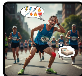
Hitting the wall feels like this

grueling running challenges imaginable. It takes many months to prepare for the long distance effort and even then once athletes surpass the 30km mark, many of them inevitably hit the wall. This means their muscles completely run out of glycogen and start to cramp. In my experience, the final 10km of the marathon are more about mental toughness than physical readiness. Ultimately, it is a phenomenal test of endurance and anyone who undertakes such a feat should be proud of their accomplishment regardless of their time!