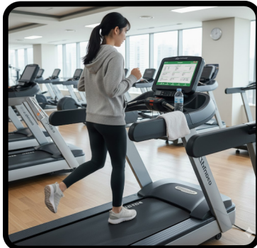
You can run on a treadmill

A treadmill is a machine you can walk or run on. It is also called a "running machine." The belt moves backwards as you walk. You can change the speed up or down. It shows your heart rate and the number of calories burned. You can run indoors on a treadmill. Be careful, you can also slip and fall!